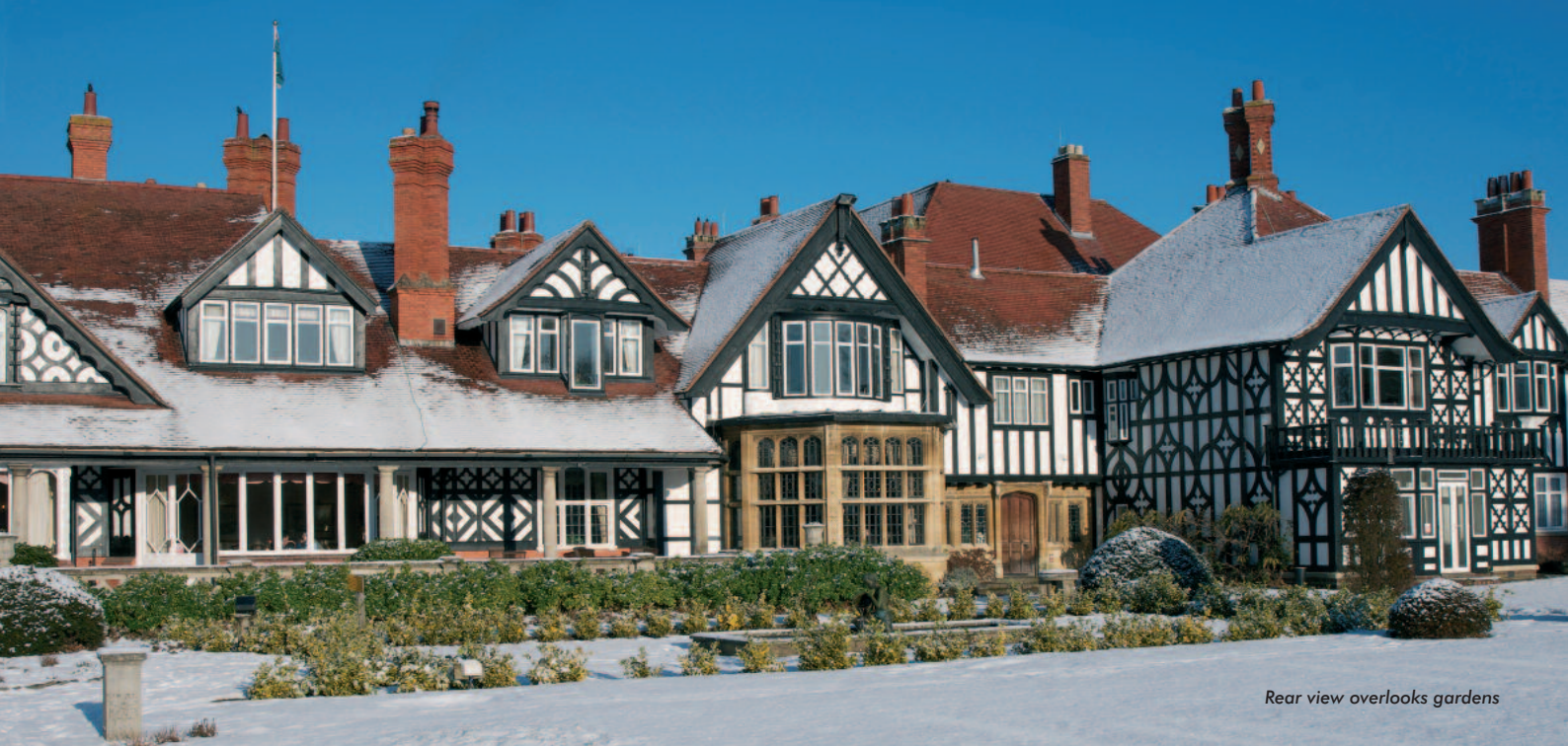
Rear view overlooks gardens